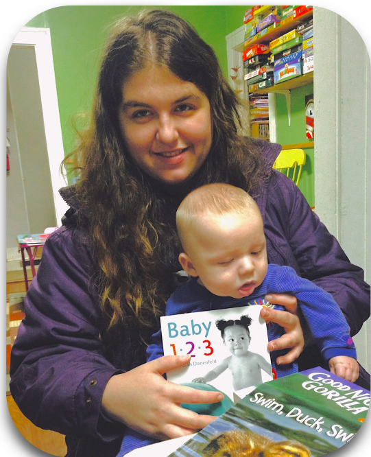
Mother and baby at Vincent Village selecting books from BookStart

On the right are some of their comments: