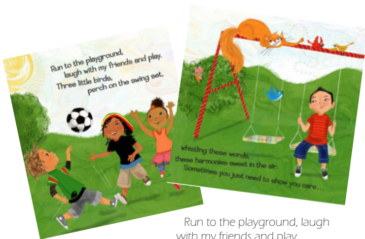
Run to the playground, laugh with my friends and play. Three little birds, perch on the swing set, whistling these words, these harmonies sweet in the air. Sometimes you just need to show you care....