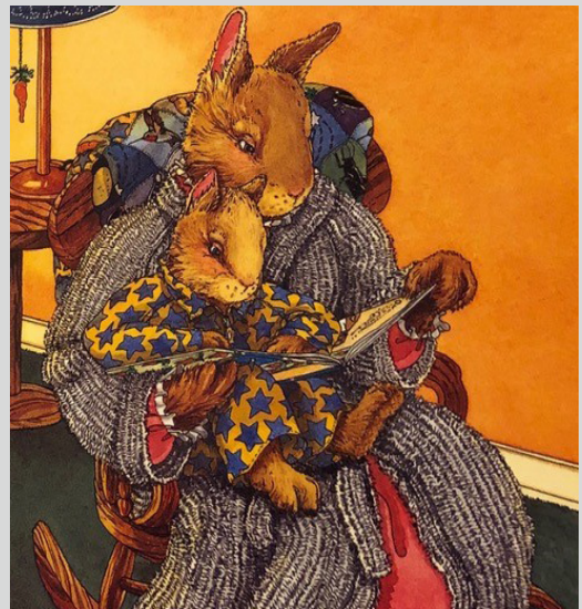
Another page from "Hush Little Baby"

Questions? Contact Ginny Clark at 260-625-3837